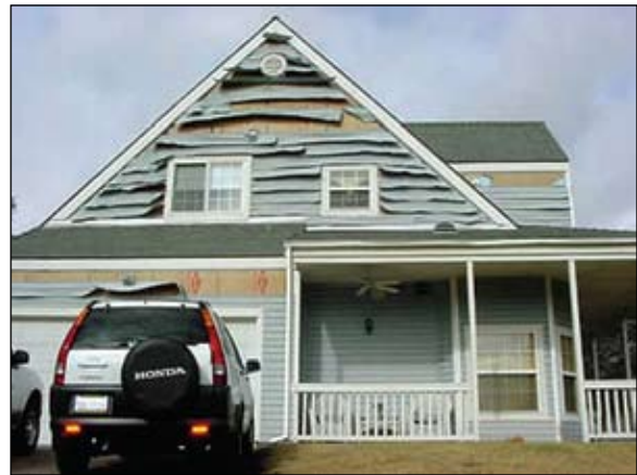
Figure 1. Vinyl siding that melted and warped during a wildfire.