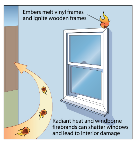
Figure 1 . Potential damage to a window during a wildfire.

This section provides guidance on glazing, frames, fire-rated assemblies, and exterior window shutters.